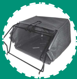
COLLECTION BAG nylon removable capacity 45 l