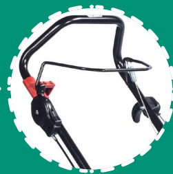
TOOL COUPLING LEVER sheet metal pressure with integrated safety system