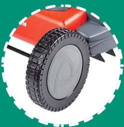
SELF-CLEANING WHEELS Ø20 cm with ball bearings