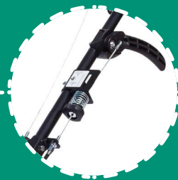
ADJUSTMENT LEVER spring rotor work depth