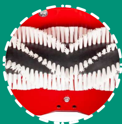
HELICAL BRUSH in nylon 36 cm 2,600 rpm